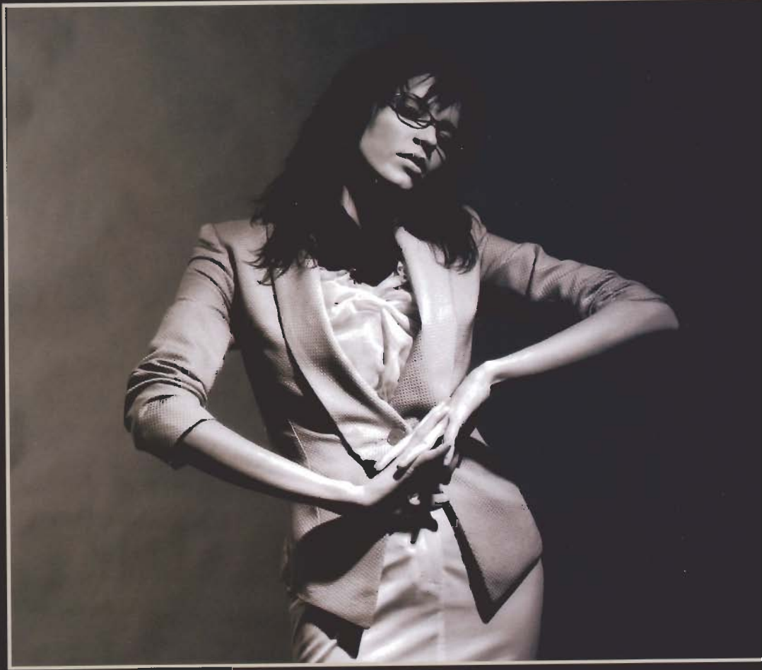
Camica nera con rouges Camiceria di Como, top bianco in chiffon Al Bini, giacca Luciano Soprani, gonna con le tasche Gazebo, Occhiali Kaos. Black blouse with flounces by Camiceria di Como, Al Bini white chiffon top, Luciano Soprani jacket, Gazebo skirt with pockets. Kaos eyewear.